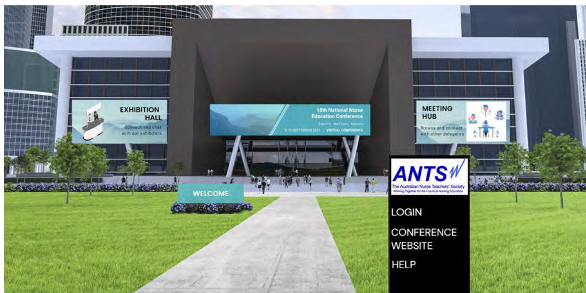
COVER: NNEC Virtual Conference 8-10 September 2021

SPRING EDITION | VOLUME 13, ISSUE 1 | OCT 2021