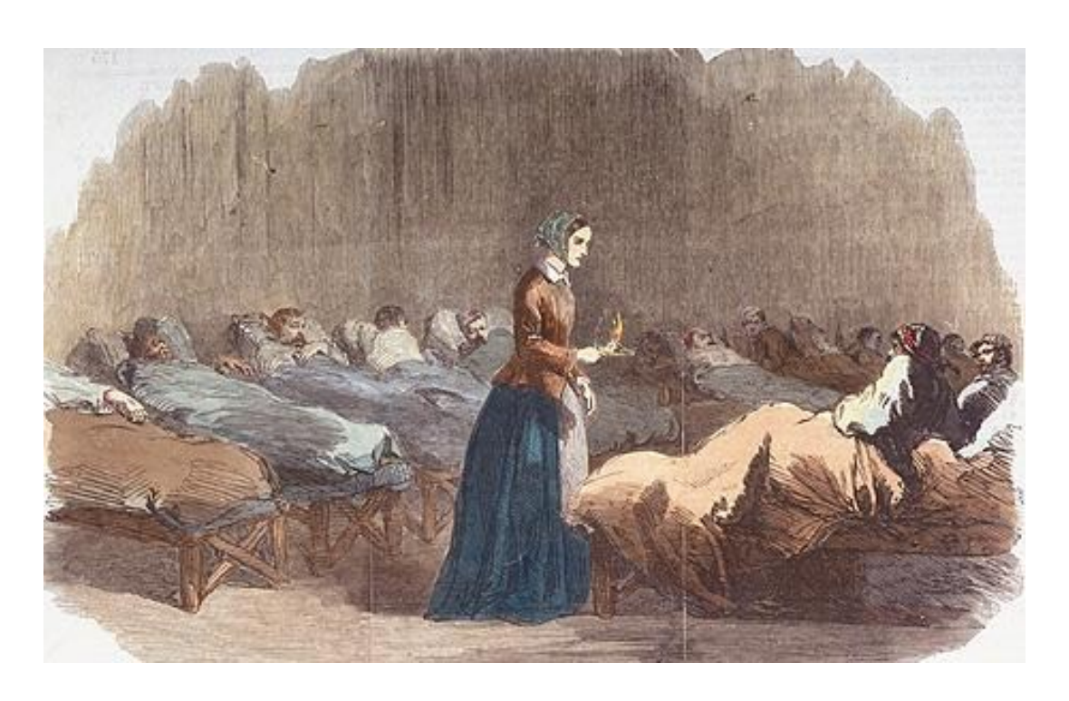
http://i.telegraph.co.uk/multimedia/archive/01695/florence_1695069c.jpg Accessed 26/3/2014